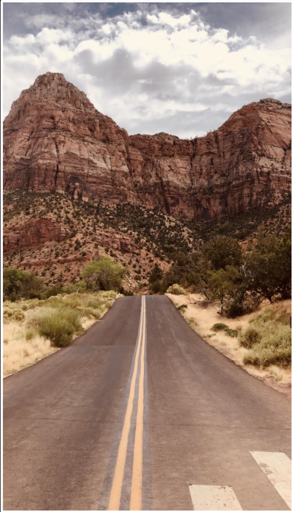
Zion National Park's entrance road in Utah.