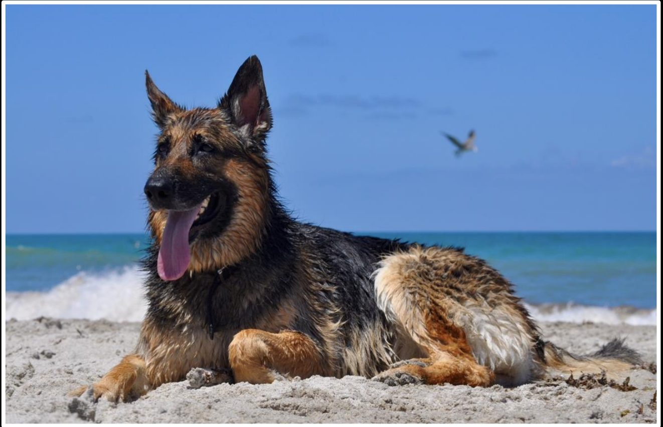
A German Shepherd lounging on the beach in St. Simons Island, Georgia.